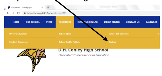
Step 4: Scroll down, click on

Step 2: Click on Resources Step 3: Click on Testing